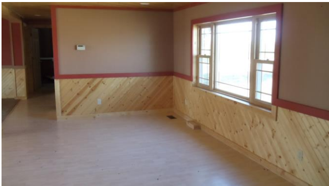
Dining room view