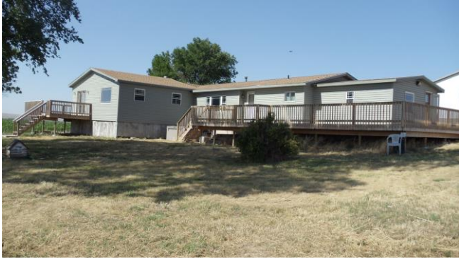
View of barn and corrals from NE