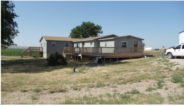
View from NE of property