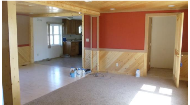
Living room & dining area