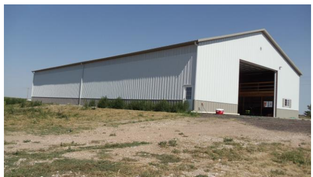
SE view of steel building