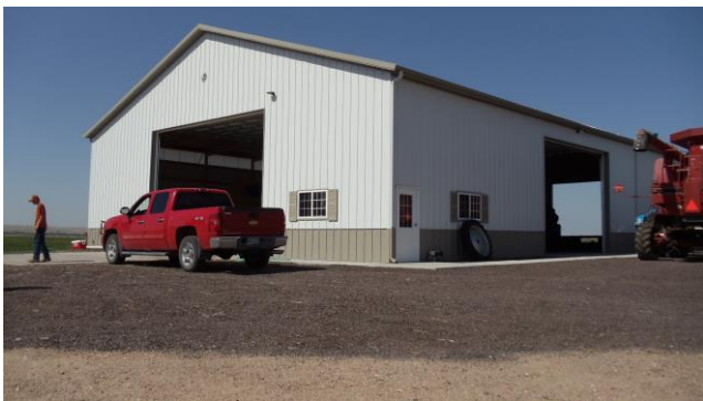
NE view of steel building