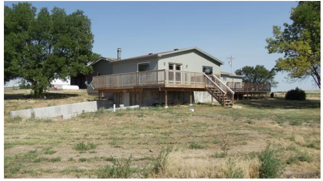
View from SE of property