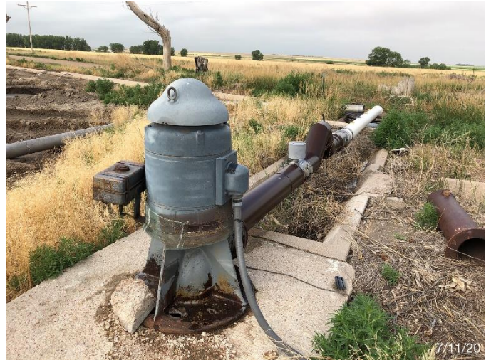
Well #2 on the property