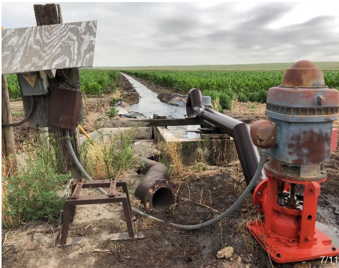
Well #1 on the property