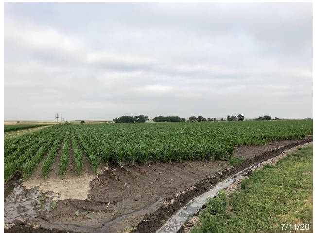
The 2020 corn crop well underway