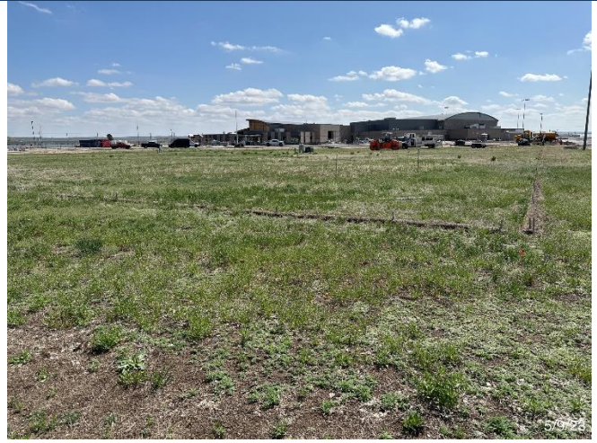
Cottonwood & Chestnut St, Julesburg