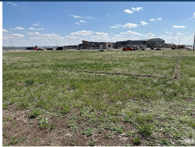
Cottonwood & Chestnut St, Julesburg