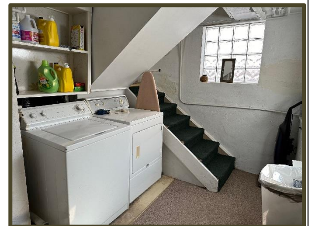
The main unit entrance and the lower-level laundry.