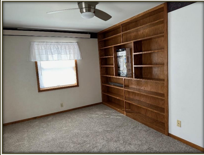
The primary bedroom and kitchen counter of the main unit.