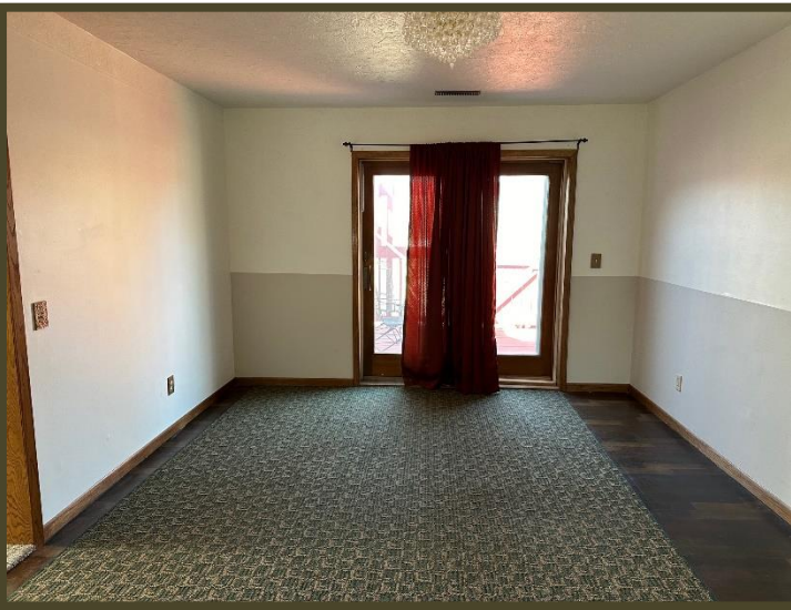
The dining room and the kitchen of the main unit. Elec range, refrigerator, dishwasher, and microwave included.